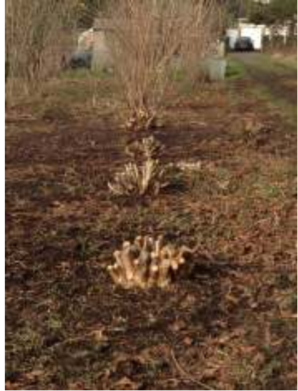
this years coppicing with next years in the background

I've made a pact with myself to grow garlic and leeks this year on my patch. These two veg are what I use most but my main motivation is the lack of flavour of shop bought garlic. Back in the day one or two cloves sufficed in a cooking pot but now increasingly I use double or triple that amount. Just as supermarket flowers have no scent to which we have become