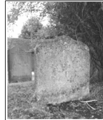
Peter the Wild Boy's grave near the church's main door in St Mary's churchyard. The inscription reads 'Peter the Wild Boy 1785'

The fame of Peter the Wild Boy was nation-wide and outlived him for many years. There are several literary references to him, including two mentions in novels by Dickens - Martin Chuzzlewit and Edwin Druid .