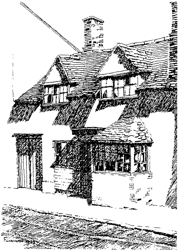
Old Cottages, Castle Street