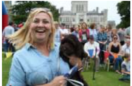
Dog show at Garden Party