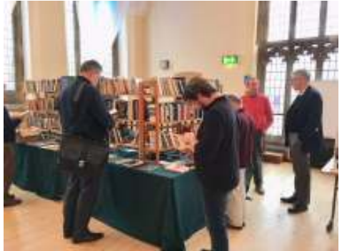
The bookstall at the 2018 festival.