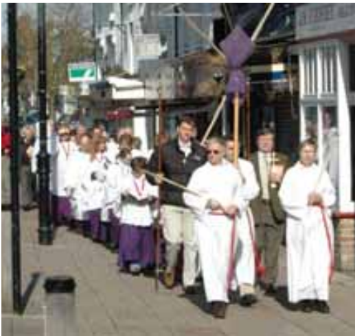
A briefly sunny Palm Sunday procession. We were very lucky this year to avoid rain.

The school has recently been accredited as a self evaluative school by Herts LEA after a stringent assessment day. We are very pleased to have achieved this accreditation. We have also submitted our application to become a green flag environmentally friendly school which is the former Gold Eco Award and are currently waiting for the assessors to come in so we can show them all we have achieved in this area. ❖